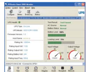
Power Management Software

* Single phase output voltage: 220/230/240 is only for 20~120KVA models.